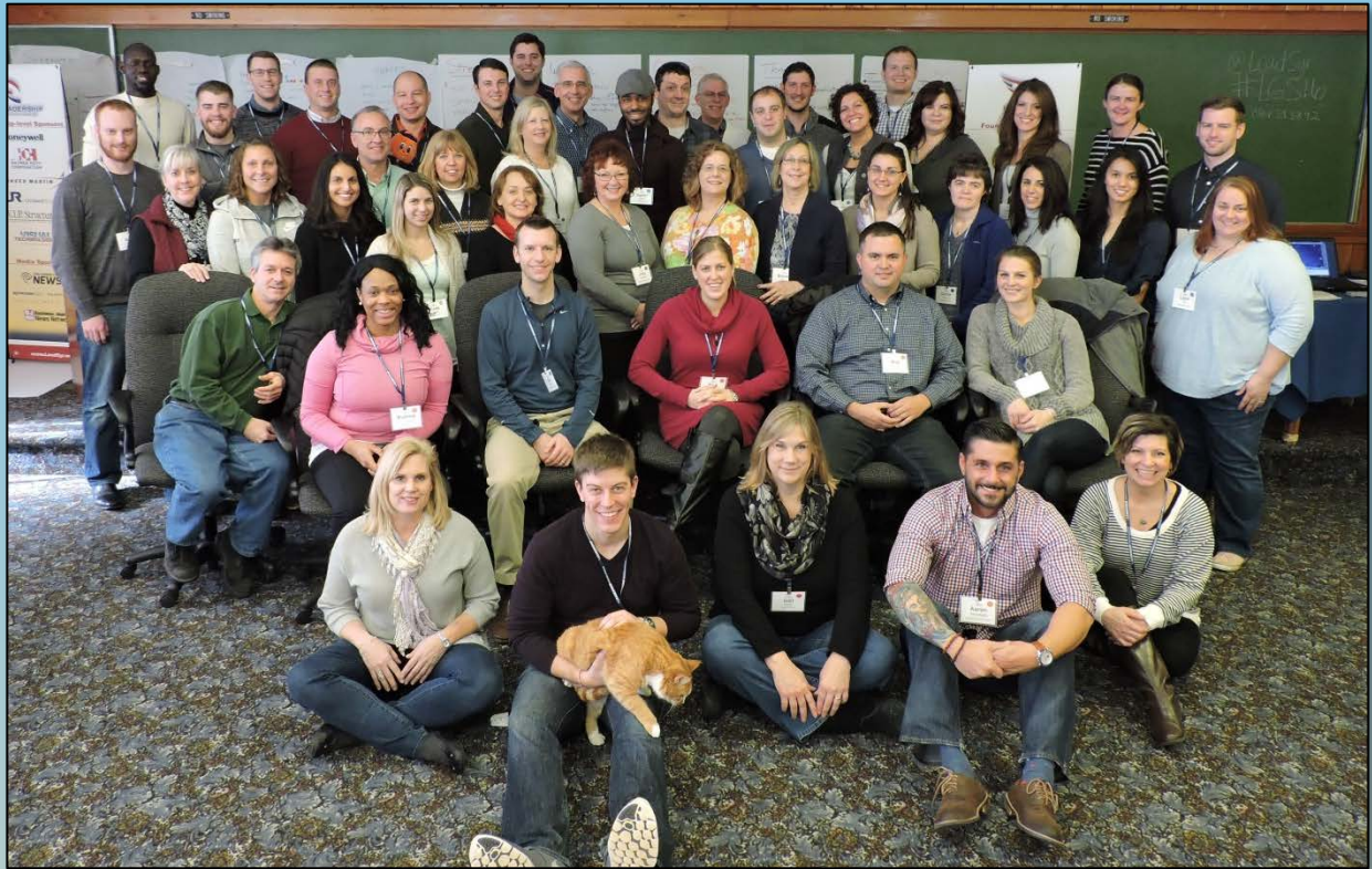
LGS Class of 2016 at their Opening Retreat.

Read 2016 Class Day blogs and learn more at: www.leadstyr.org