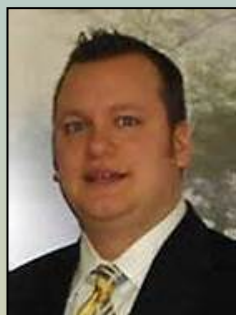
Bob Tackman, East Syracuse Mayor