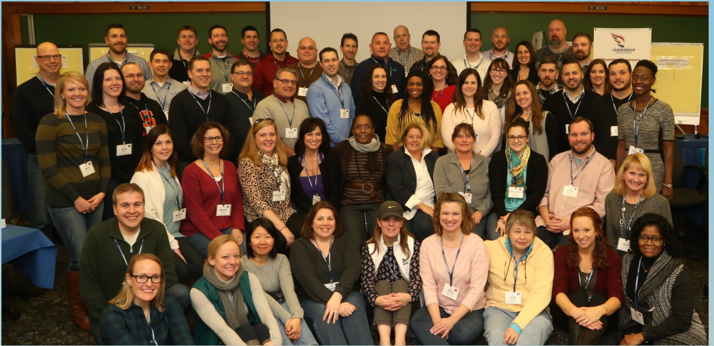
LGS Class of 2017 at their Opening Retreat.

Read 2017 Class Day blogs and learn more at: www.lead syr.org